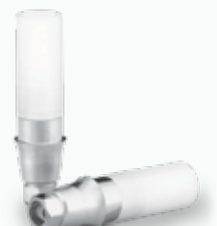
Custom and CAD/CAM Abutments**